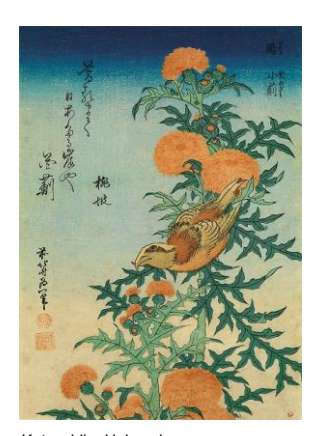
Katsushika Hokusai Crossbill and Thistle The Sumida Hokusai Museum (2nd term)