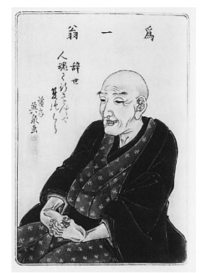
Keisai Eisen, Hokusai portrait