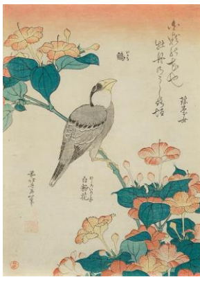
Katsushika Hokusai Japanese Grosbeak and Four-O'Clock The Sumida Hokusai Museum (2nd term)