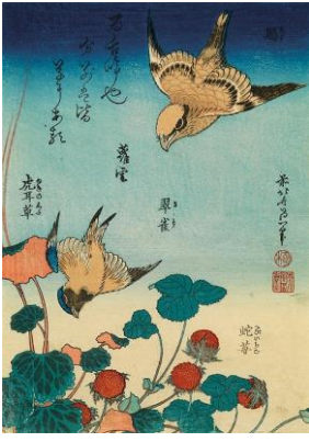
Katsushika Hokusai Bull-headed Shrike and Bluebird with Begonia and Wild Strawberry The Sumida Hokusai Museum (1st term)

Katsushika Hokusai, Lesser Cuckoo, The Sumida Hokusai Museum (1st term)