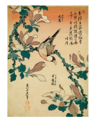
Katsushika Hokusai Java Finch and Kobushi Magnolia The Sumida Hokusai Museum (Exhibit full-term with changes in works)